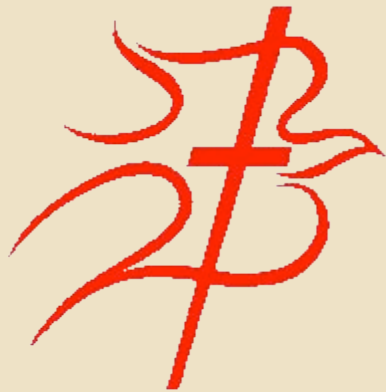
Anglican Renewal Ministries