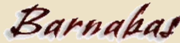
Barnabas Anglican Ministries